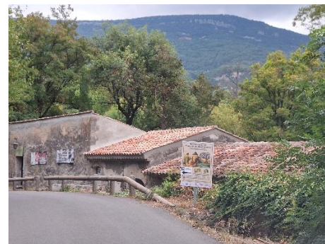
The outside of the roof after

And that's just the beginning! The renovation continues!