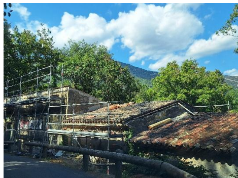
The outside of the roof before

After three months of work, the roof has finally been totally redone on the mill side and re-covered on the side that houses the ancient "ressence".